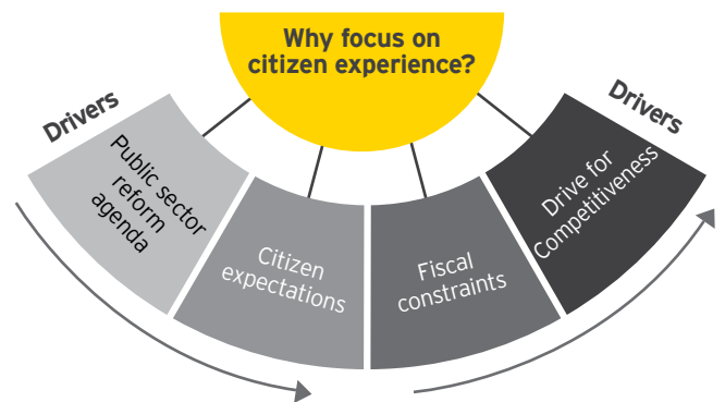
Figure 1: Factors driving GCC governments to embrace citizen experience

The GCC region is no exception. While the fundamental drivers to improve citizen experience are similar across the globe, the region's current economic and sociodemographic dynamic makes certain factors more prominent than others. Through our research and experience of working with government agencies in the region and globally, we have arrived at four main factors that are driving governments to focus on citizen experience, as outlined in Figure 1.