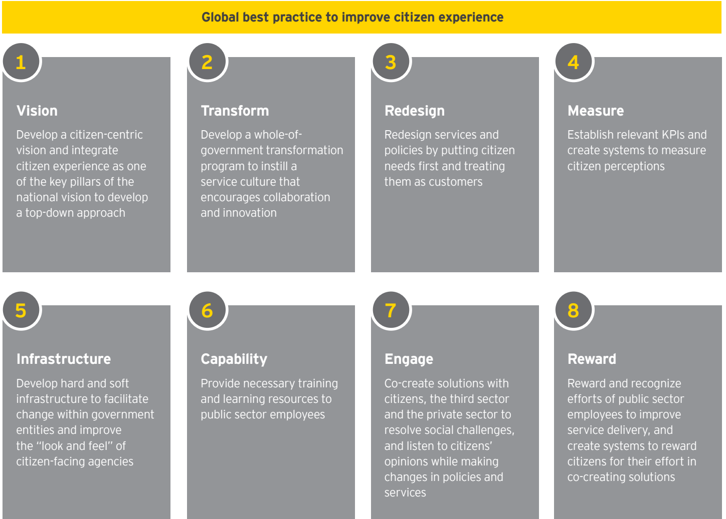
Figure 3: Global best practice to improve citizen experience